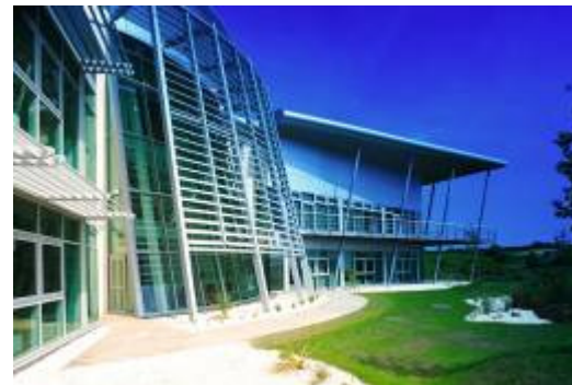
Technium Performance Engineering