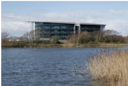
Technium Sustainable Technologies