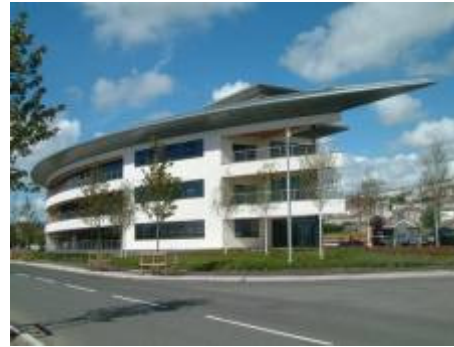
Technium Swansea (building 2)