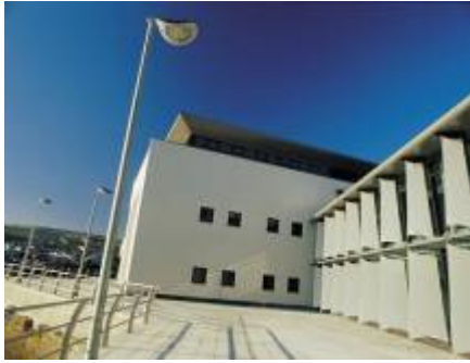
Technium Swansea (building 1)